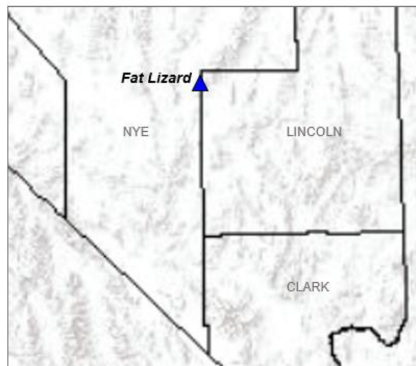
Figure 2: Map of southeast Nevada showing location of Fat Lizard project

The Fat Lizard project, Nye County, Nevada is a low-sulfidation epithermal target with no historic drilling. (Figure 2).